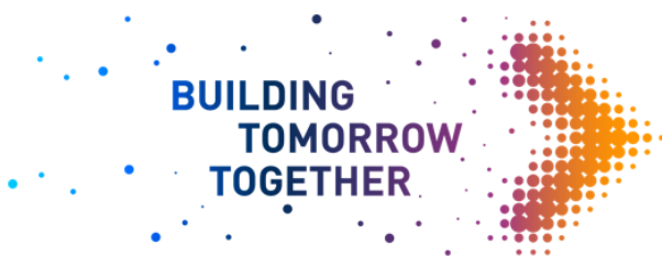
Image: Borealis, Borouge and Nova Chemicals will be building tomorrow together at the K 2019

A joint Pre-K 2019 kick-off will take place on 25 June 2019 at Borealis Innovation Headquarters in Linz, Austria. Borealis, Borouge and NOVA Chemicals will provide a preview of their featured topics and activities at the upcoming K 2019 in October. They will be joined at this event for the first time by a value-chain partner, EREMA Group, the global market leader in the development and production of plastics recycling systems.